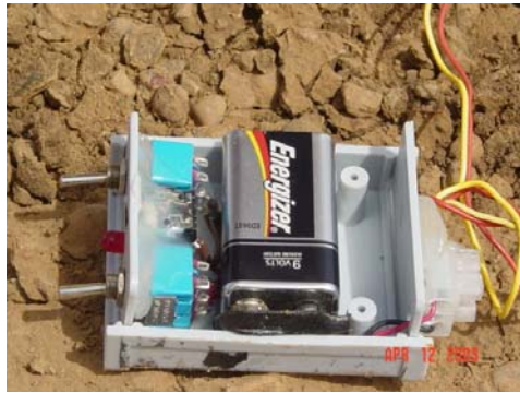
Firing Device with Lanyard Port, Two Toggle Switches, and 9V Battery.