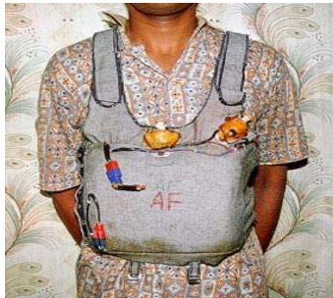
Suicide Vest Used by the LTTE – dual electric firing system, military grade explosives, ball bearings